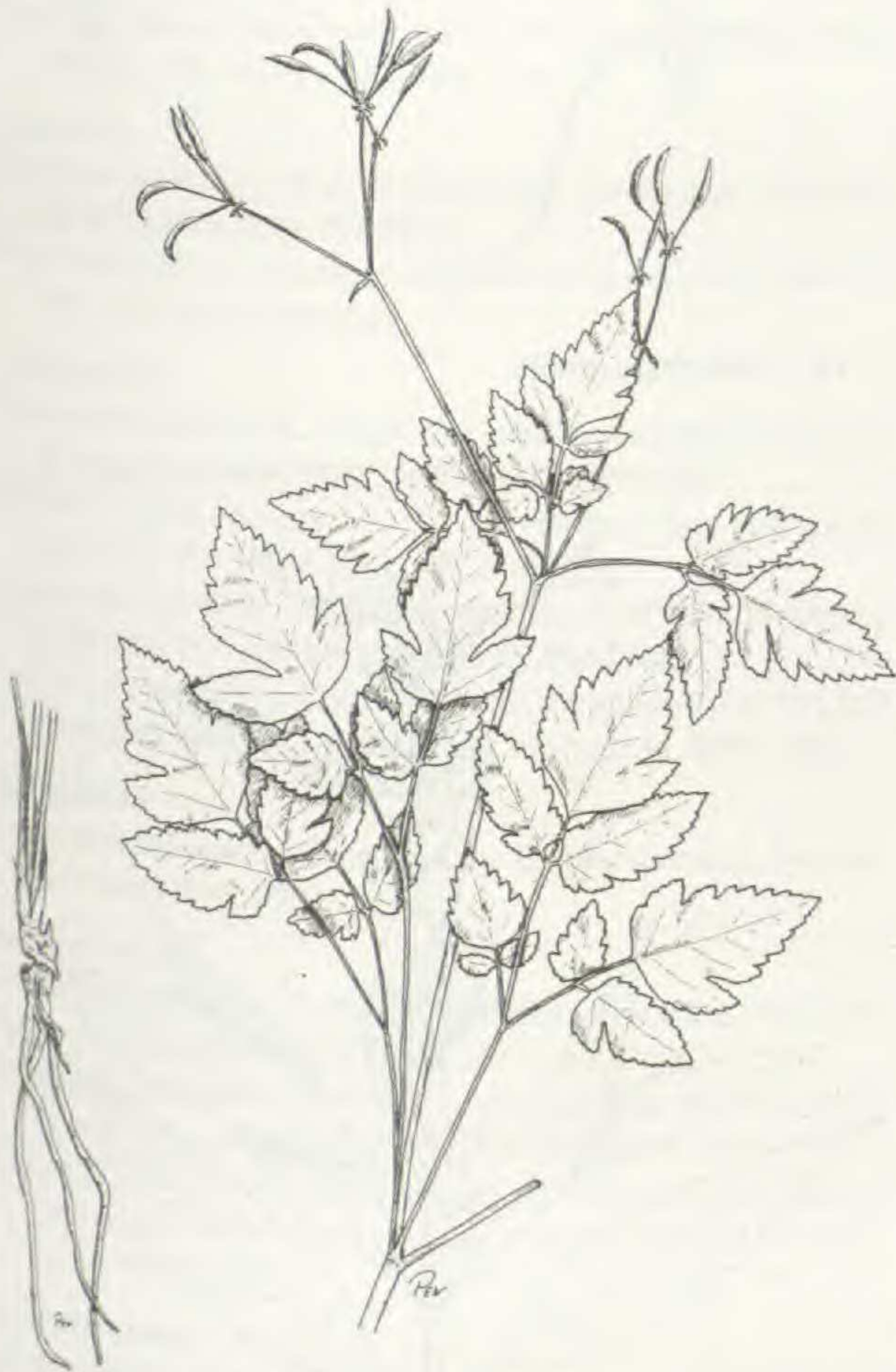
FIG. 4. Osmorhiza longistylis .